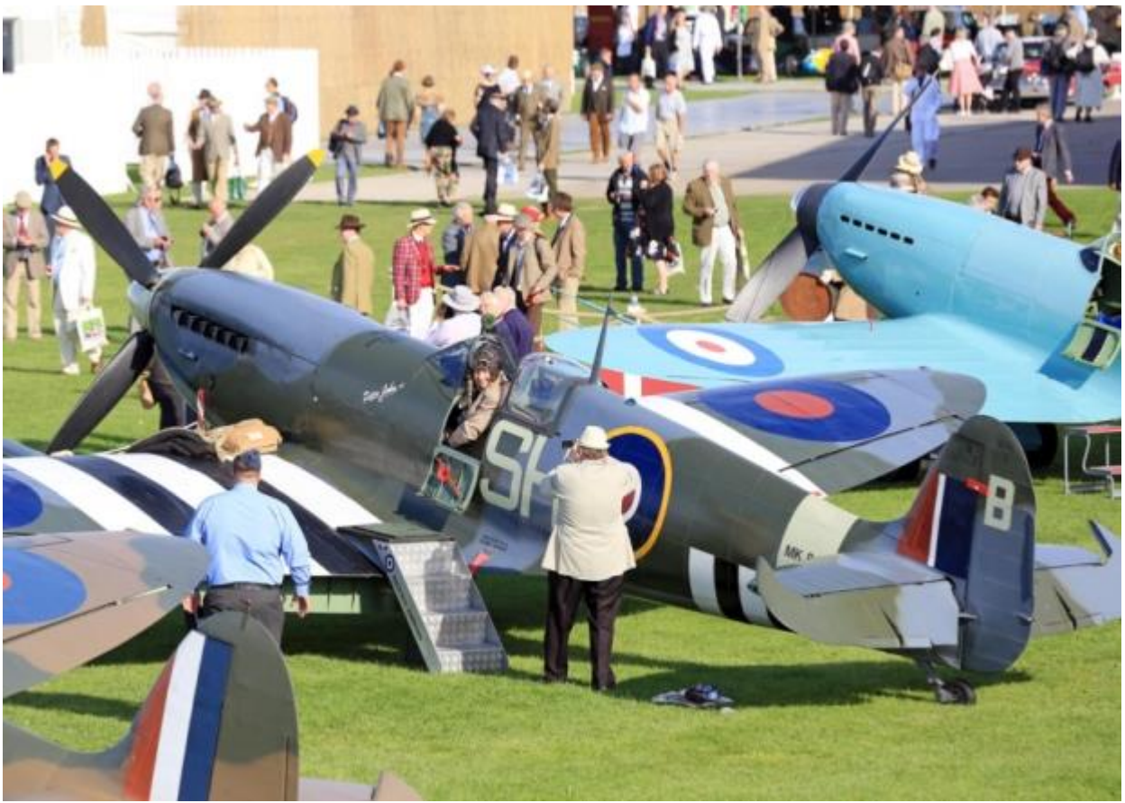
Spitfires as part of the display at last year's Goodwood Revival

Goodwood also believes the South Downs National Park would be negatively affected by a new Lavant bypass around the city, and fears it would put at risk major events like the Festival of Speed.