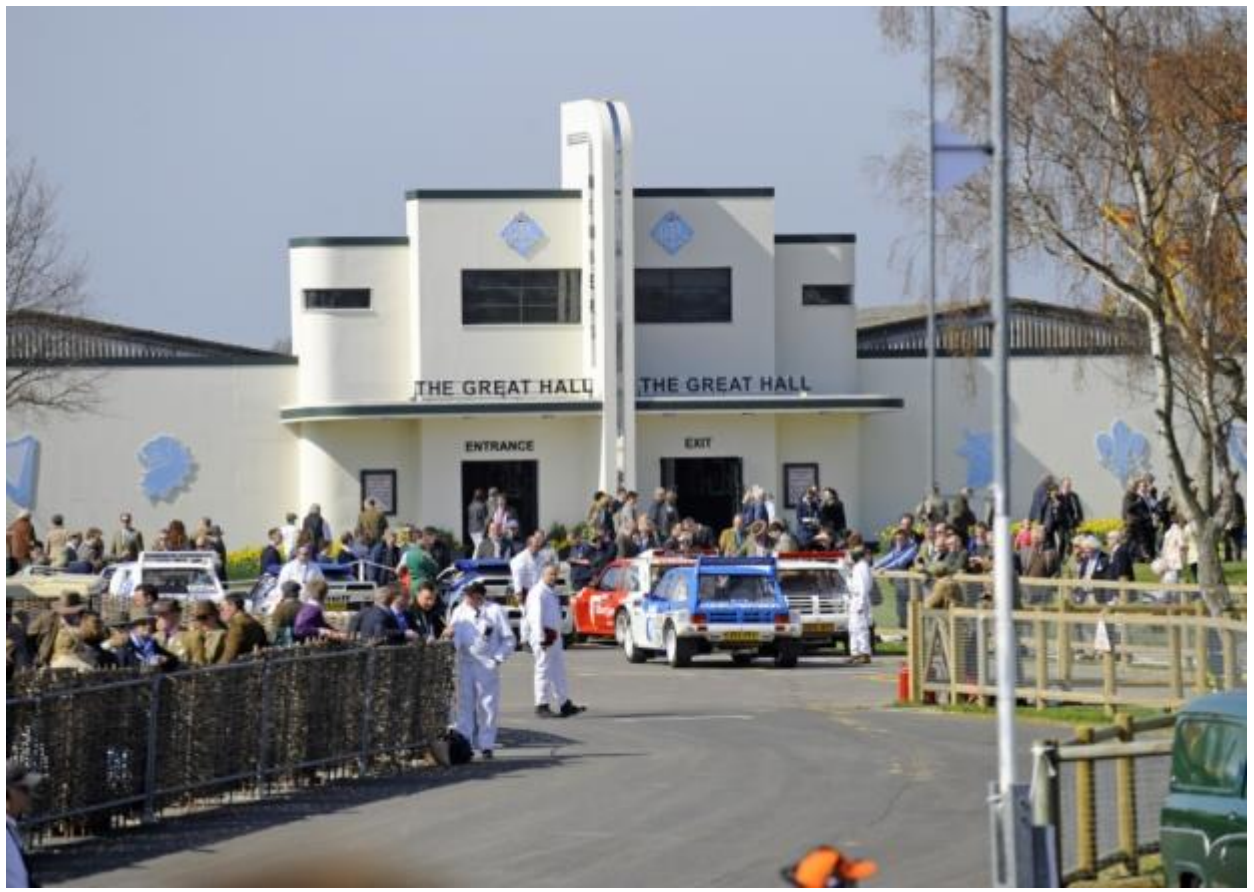
Last year's Members' Meeting at Goodwood, one of several major events that Goodwood fears would be at risk by a northern route